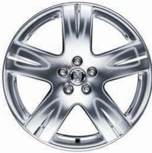
19" Chrome Sabre