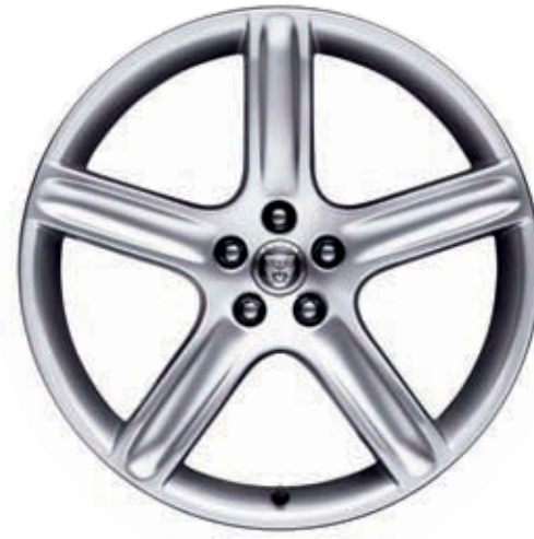
20" Callisto alloy