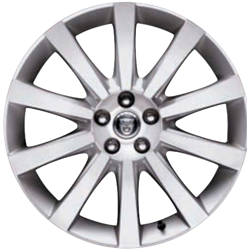
19" Carelia alloy