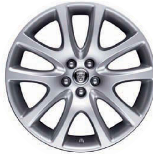
19" Polaris alloy