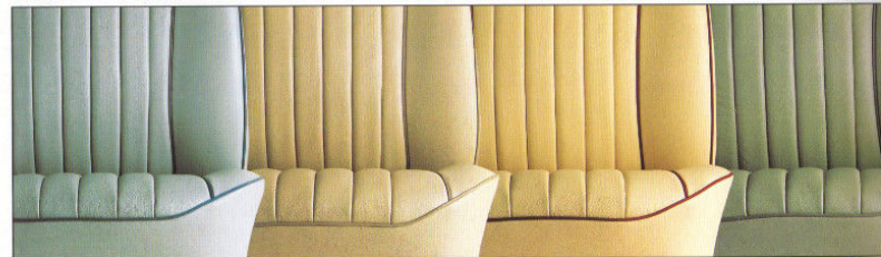
SAVILE GREY/ISIS BLUE PIPING

Isis Blue Cherry Red Barley Sage Green Coffee